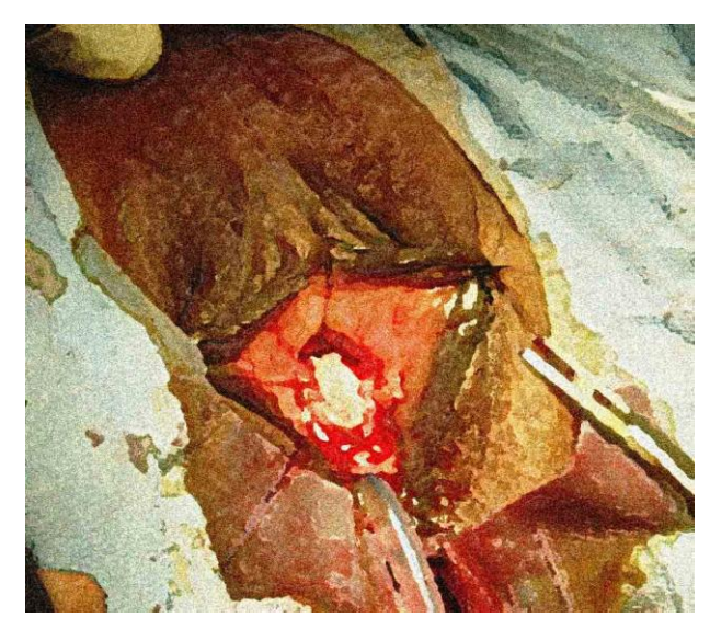
graft applied over defect