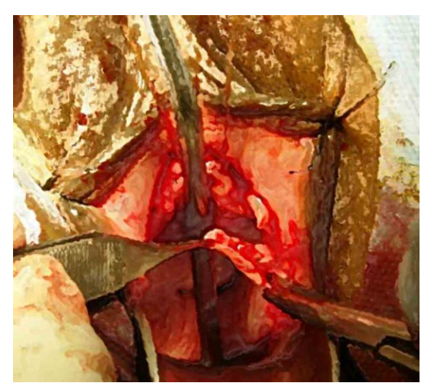
Vestiblar graft raised