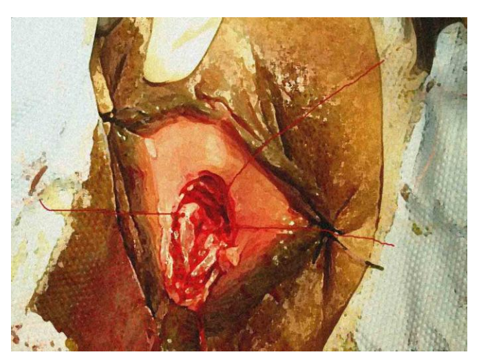
Defect identified and stay sutures taken