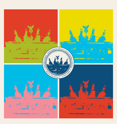
Preliminary Programme & Registration Information

ICS Educational Courses are heavily subsidised by the ICS and are aimed at young doctors, allied health professionals and scientists who may be unable to attend the ICS Annual Meetings due to a lack of funding. www.icsoffice.org