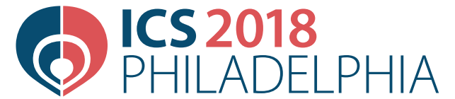
ICS 2018 Dark two colour logo