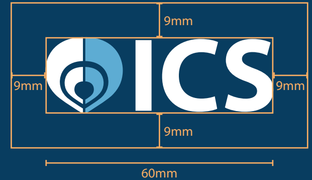
Exclusion margin 15% of logo width