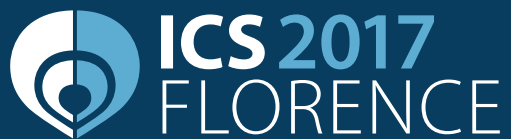
ICS 2017 Standard two colour logo