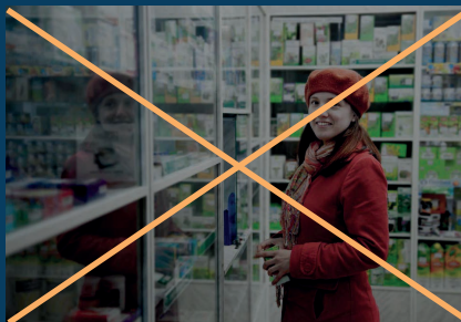
Incorrect: Poorly lit