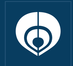
Single colour ICS emblem