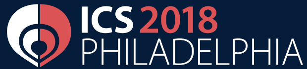
ICS 2018 Standard two colour logo