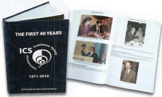
ICS History Book