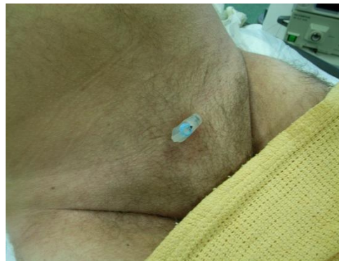
Bladder Button in situ