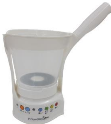
Fig 1. P-Flowdiary

P-Flowdiary® is convenient and easy-to-use at home even in the elderly. We have proved the practical usefulness as a screening tool for voiding dysfunction, which provides better informed consent as well as assessment of therapeutic performance for every patient. However, the clinical usefulness of uroflowmetry and self-assessment of every urination is not clarified yet.