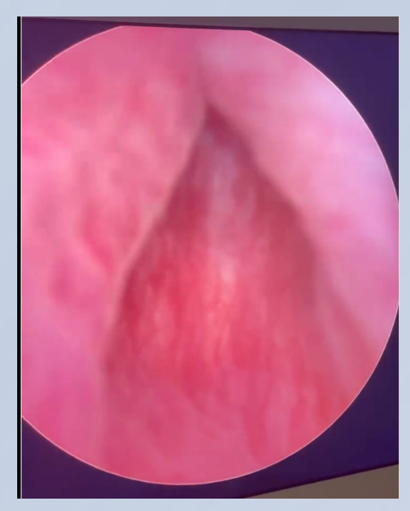
Figure 2: Cushions of polyacrylamide gel seen on urethroscopy

Current literature on the development and management of UI after phalloplasty is scarce with only two prior studies identified [2,3]. Hoebeke et al and Zhang et al reported rates of UI ranging from 50-59%. However, unlike our patient, both studies reported only mild UI or post void dribbling, related to lack of neourethra musculature, which did not warrant further intervention.