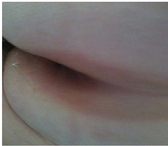
IAD in between and outside of the buttocks