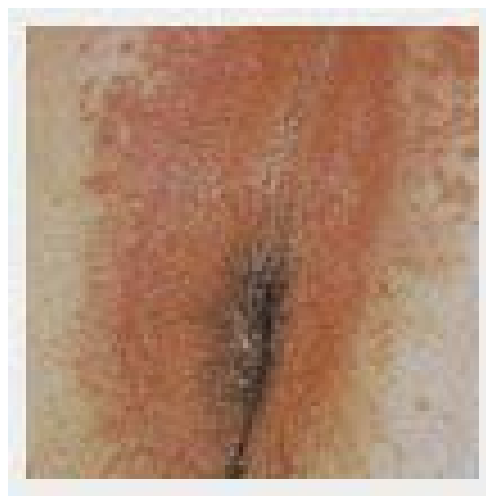
IAD and rash of fungal infection