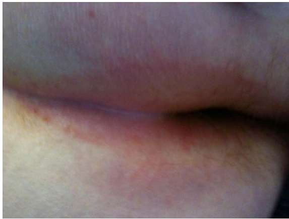
IAD in between and outside of the buttocks

The skin damage of inflammation from Incontinence associated dermatitis (IAD) appears as redness that can vary in shade from light pink to bright red. In darker-toned skin, inflammation may appear as redness or as patches of darker or lighter coloring. Damaged skin may also look shiny and wet, with local swelling or fluid buildup. A fungal (yeast) infection can develop in IAD and appears as a rash. Flaking of skin may develop as the infection heals. IAD can develop in any body area exposed to leaked feces or feces and urine but most often occurs around the anal opening and between and on the buttocks