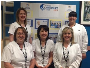
The Eastern Health Nurse Contenance Advisors.