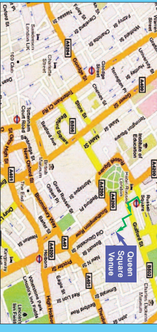
Directions to the National Hospital for Neurology and Neurosurgery:

33 Queen Square, London WC1N 3BG A4200 8502