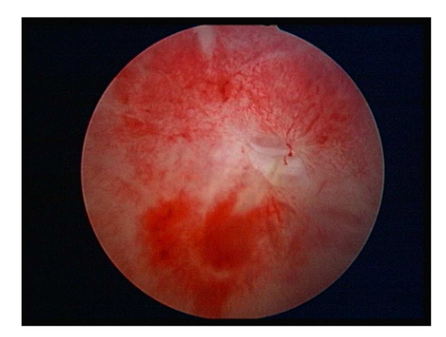
Fig. 1. Hunner lesion.

Ketamine Cystitis is a new condition not previously described. Caused by recreational ketamine abuse, ketamine cystitis includes increased voiding, frequency, dysuria, bladder pain and hematuria.<sup>105,106 FN57</sup>