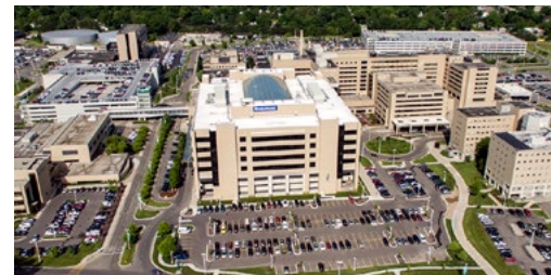
Beaumont Hospital, Royal Oak, Michigan

3601 West 13 Mile Road • Royal Oak, MI 48073