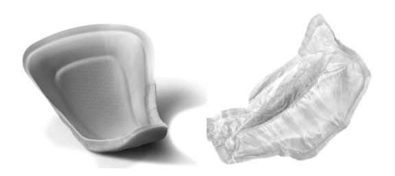
FIGURE 4 Examples of male pads