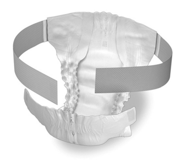
FIGURE 8 Example of a belted pad (belted product)