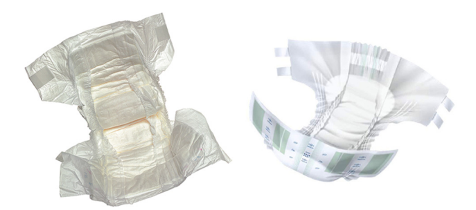
FIGURE 7 Examples of all-in-ones (wrap-around pads, adult briefs)

We recommend that products of the kind shown in Figure 3 should be called unbacked pads —absorbent