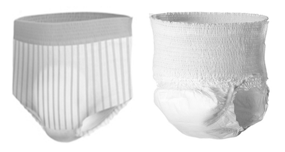
FIGURE 6 Examples of pull-on pads (protective underwear)

products that are held in place using separate, close-fitting (regular or specially designed) underwear. The defining features of pads and the main variant features are described in Table 1, while the construction of a simple variant is shown in Figure 1A. Although the online questionnaire found clear international consensus in favor of pad, two alternative names (insert and liner) were popular in some countries, but never more popular than pad (Supporting Information, Appendix C: Figure C-1 and Table C-1, https://www.ics.org/Documents/Documents.aspx?DocumentID=5973). Accordingly, use of these two terms—and others favored by small groups of respondents—is discouraged Table 2.