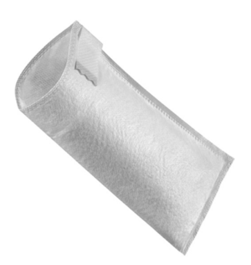
FIGURE 5 An example of a male pouch