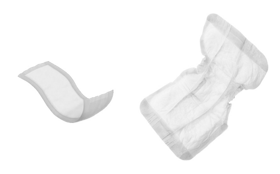
FIGURE 2 Examples of pads

on Wiley Online Library for rules of use; OA articles are governed by the applicable Creative Commons Licens