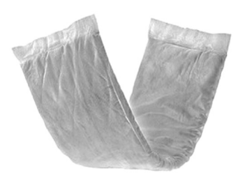
FIGURE 3 An example of an unbacked pad

The absorbent core of an absorbent incontinence product is where urine is captured and stored. It is made from (a) material(s) which absorb(s) urine readily and retains it under pressure, such as when the wearer changes posture or position.